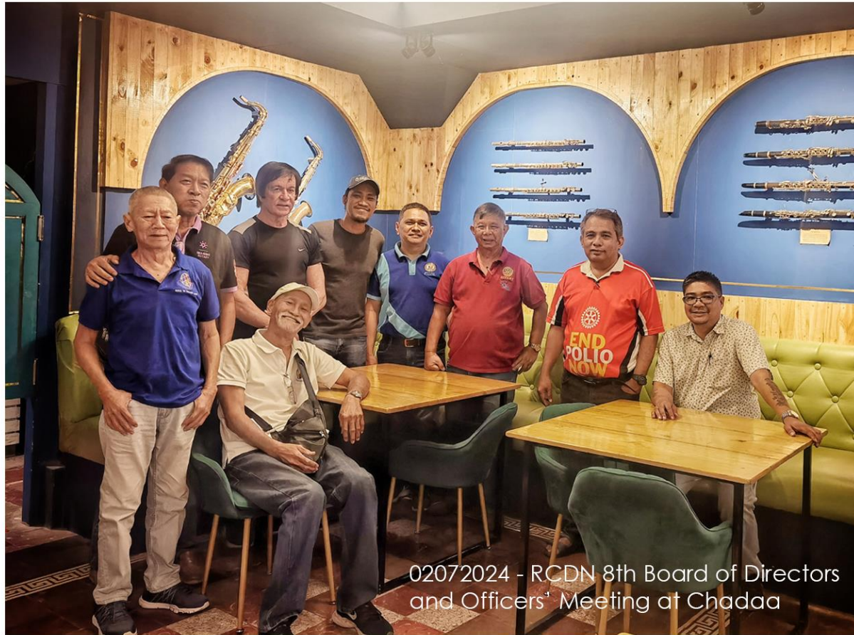
02072024 - RCDN 8th Board of Directors and Officers' Meeting at Chadaa