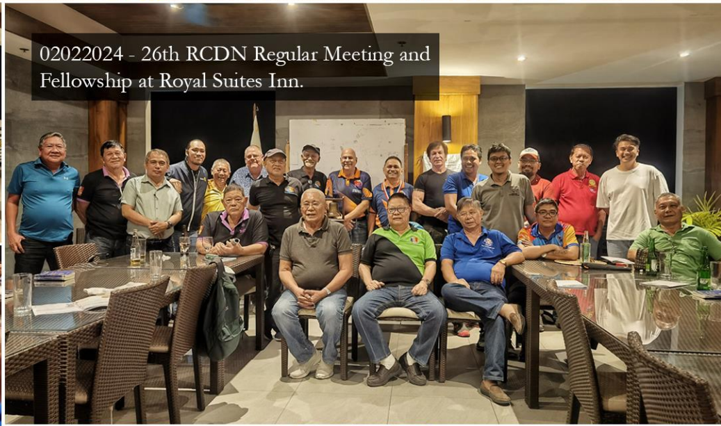
02022024 - 26th RCDN Regular Meeting and Fellowship at Royal Suites Inn.